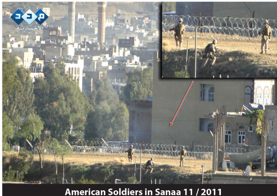
American Soldiers in Sanaa 11 / 2011

It's no longer a secret that American intended to occupy Yemen since right from the start of the crusader war against Muslim countries, the ex-defence secretary Rumsfeld said after the fall of Baghdad near the end of March 2003CE – according to the Gulf Times that “Yemen and Nigeria are the next targets in the US 'War on Terror'”. Those statements were not merely empty words; as America gradually worked